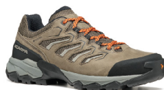
MEN'S | FOSSIL BROWN