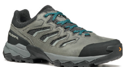
MEN'S | ANTHRACITE