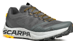
MEN'S | ANTHRACITE / SAFFRON