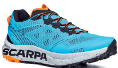
MEN'S | AZURE / BLACK