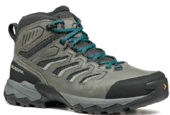
MEN'S | ANTHRACITE