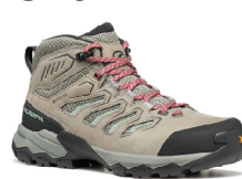
WOMEN'S | MINERAL