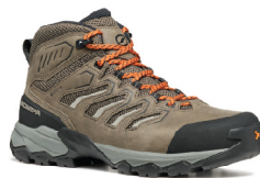
MEN'S | FOSSIL BROWN