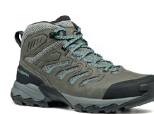
WOMEN'S | ARCTIC